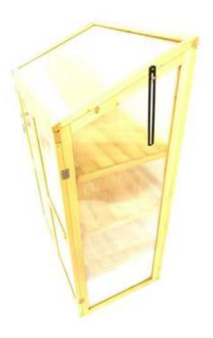
6. Screw N with J, screw M on B.

6. Screw on the open/close bar (N) using 1 screw (J) onto the lid (E), then screw the wing nut (M) into the prefixed nut on the side (B).