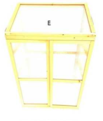
4. Fix E to C with J x 4 PCS