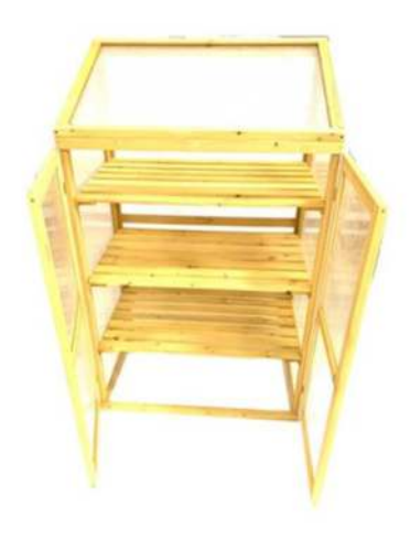
5. Put in H x 3pcs