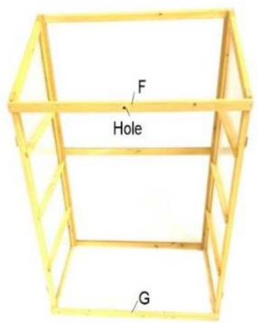
2. Fix F & G to A & B with screws L x 4 PCS

2. Attach the top bar (F), with the hole for the screw facing forward as shown, to the sides (A & B), then attach the bottom bar (G) to the sides, using 4 screws (L).