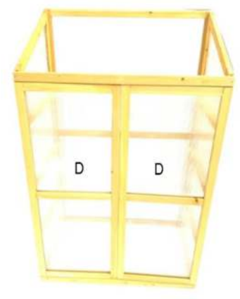
3. Fix D to A & B with J x 8 PCS

3. Attach the 2 doors (D) to the hinges on sides (A & B) using 8 screws (J)