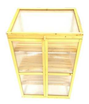
7. Screw I on F with K

7. Once the unit is fully assembled, tighten all screws. Then fix on the door latch (I) into the hole on the top bar (F) using screw (K).